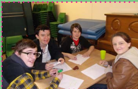
Caerphilly Young Carers.

Many thanks to Literature Wales for involving us in these two exciting projects, we hope to work together again.