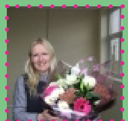
Good Luck Charlotte!