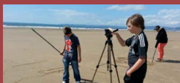
Aberavon Iconic Beach Workshop